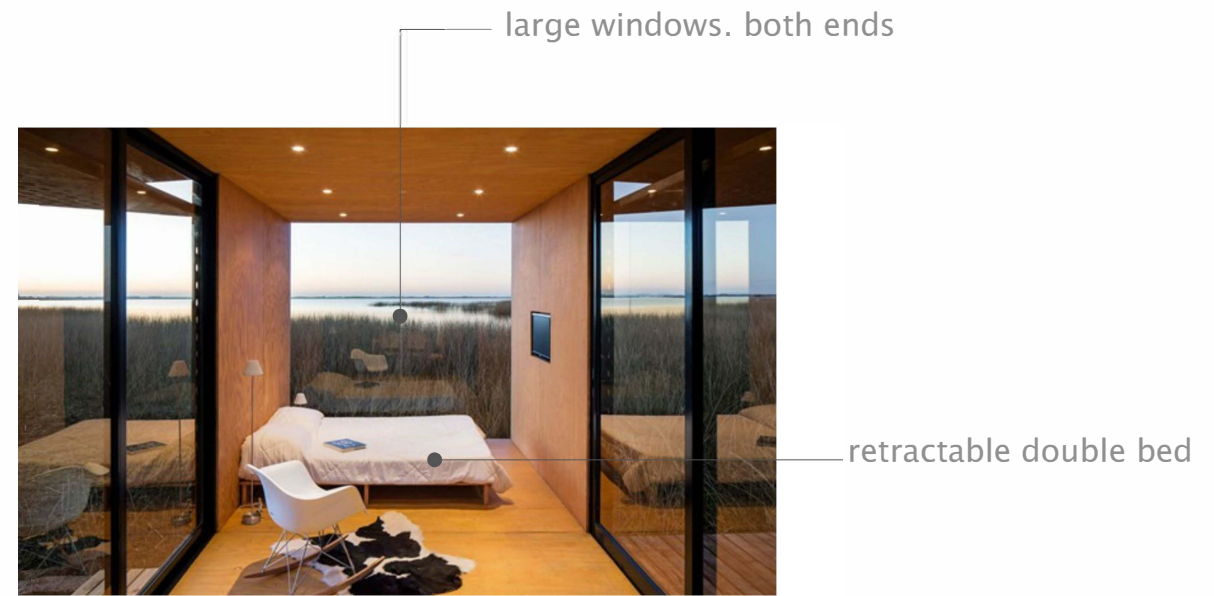
Example first floor