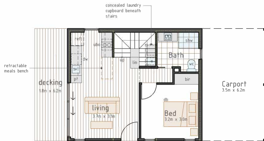
○ ground floor